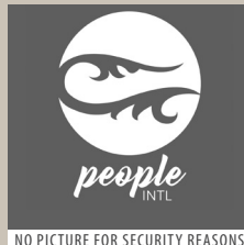
“Reaching the Final Frontier” REPRESENTATIVE People International