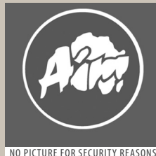
“Reaching the Nations Next Door” REPRESENTATIVE Africa Inland Mission